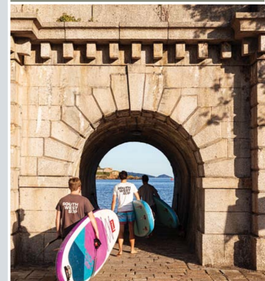
Plymouth offers a fantastic range of watersport activities, including stand up paddleboarding, canoeing and diving.