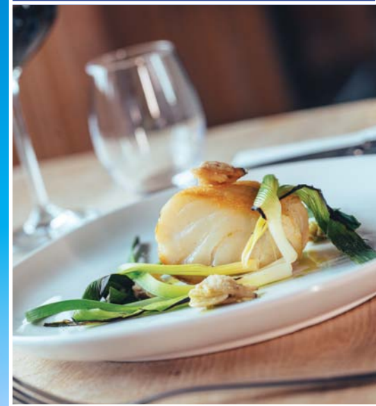
Plymouth boasts the second highest number of Gold Anchor marinas in the UK offering some of the best berthing facilities.