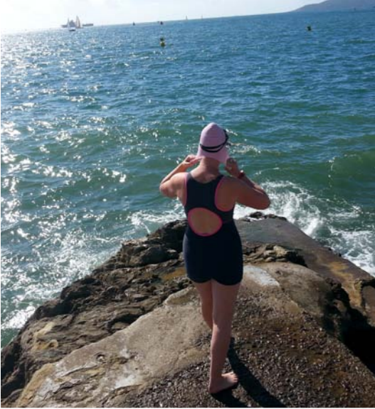
Britain's Ocean City is working to create the UK's first National Marine Park