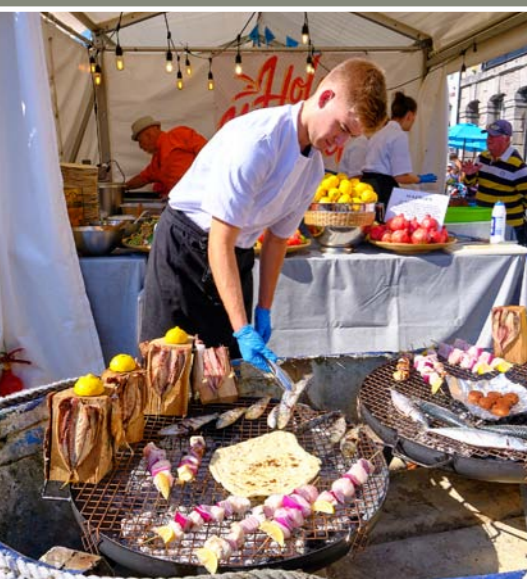
SailGP, one of the world's most impressive sailing events, hosted its third event of Season 2 in Plymouth.