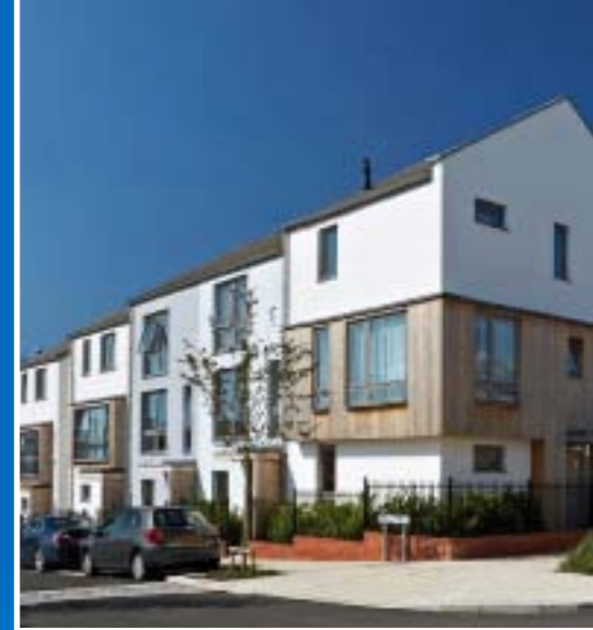
Average house prices in Plymouth are around 31 per cent cheaper than the national average.

Plymouth is home to the second largest fish market in England, and sells over 6,000 tonnes of fish each year! A fantastic place to get the freshest locally caught fish.