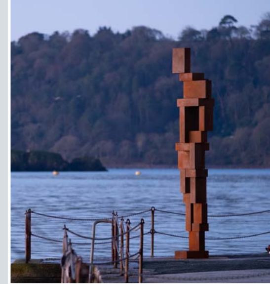
'Look II' on West Pier is an impressive sculpture by world-renowned artist, Sir Antony Gormley

Further afield you've got the wild expanse of Dartmoor offering idyllic walks, rugged Tors and great terrain for walking, cycling or horse riding, whatever takes your fancy.