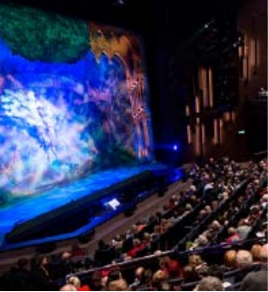
Theatre Royal Plymouth is the best attended and largest regional producing theatre in the UK